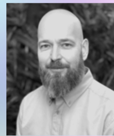
VALUE CHAIN & PRODUCTION FLOW THOMAS STEINDAHL